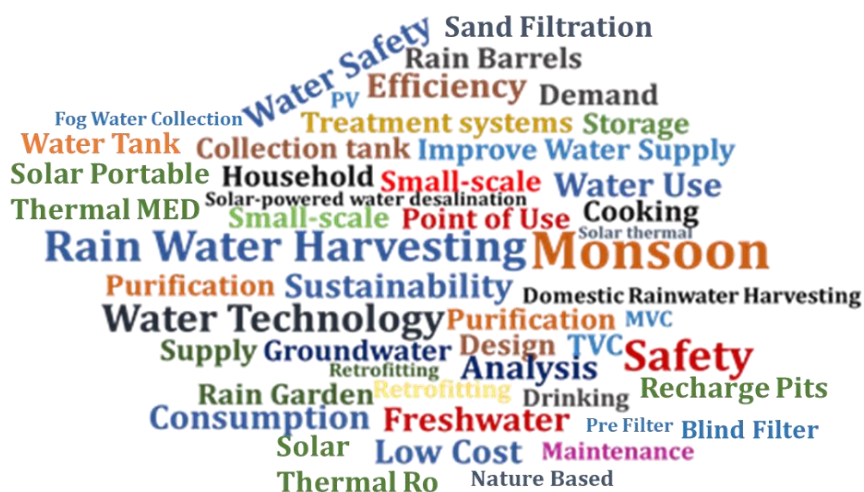
Figure 2. Word cloud of Relevant keywords to understand of sustainability of water technology.

(Scholz, 2013) From the planning perspective, sustainable water usage entails guaranteeing enough supplies of fresh, clean water for present and future generations and the environment. It addresses all watershed waters, including stormwater, transmitted as surface water in rivers, creeks, reservoirs, dams and subsurface water resources.